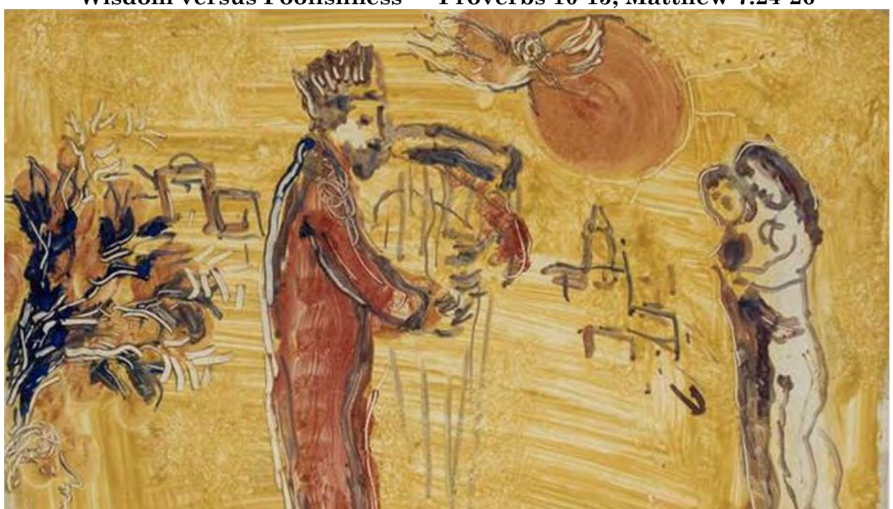
Wisdom versus Foolishness — Proverbs 10-15, Matthew 7:24-26