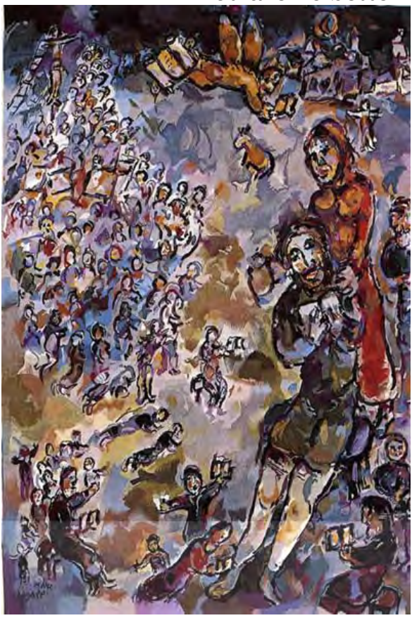
You are no better — Job 12-14, James 4:11